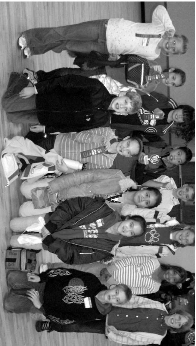
McKinley 5th graders placed second in a Battle of the Books competition recently. In all, 13 students took part, reading classic literature and answering questions as a team based on the books.